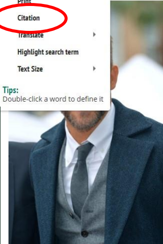
Canadian actor Ryan Reynolds